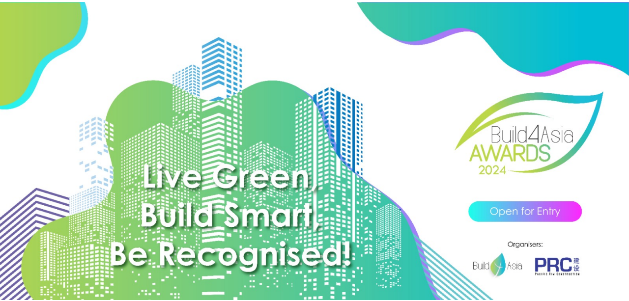
Exhibit Now 立即參展

For details, kindly visit 詳情瀏覽 http://www.smefund.tid.gov.hk